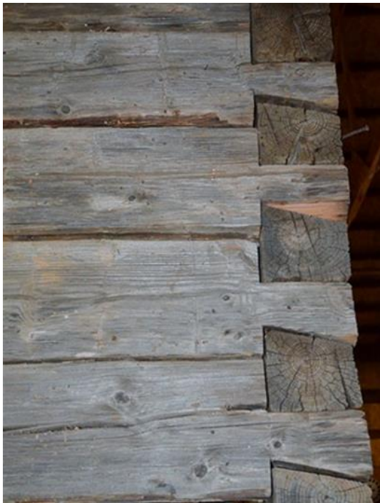
The logs were hewn and notched so expertly that no chinking between them was needed to keep out the cold.

These questions—and some historical theories—will be explored in a special presentation to members of the Molalla River Alliance at its annual meeting on Friday, May 5 at the Molalla Retreat.