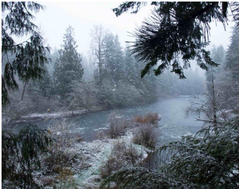
The confluence hole