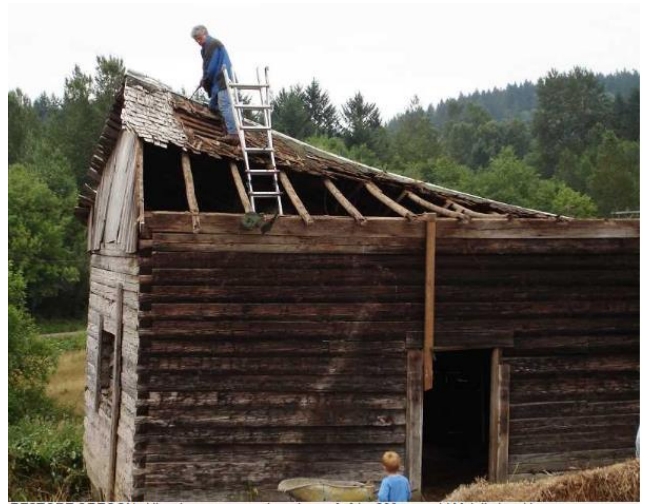
Variously used as a house, granary, animal shelter, machine shed and hay storage building over many decades, the Molalla Log House was saved from collapse in 2008, dismantled, and moved to a warehouse for rehabilitation.

The presentation will be given by architectural historian Pam Hayden, who helped save the historic structure from collapse and has worked for many years to unravel its mysteries.